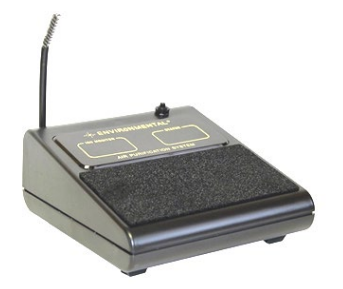
Wein VI-2500 High-Density Ionic Air Purifier Amazon $75

to minimize ozone, which can be a dangerous byproduct of some devices. The team at Columbia University who tested these devices recommend the