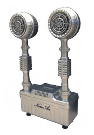
Nature Air, $240 at www.cet.org